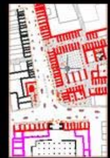
PLAN DEMONSTRATING PUBLICRELM