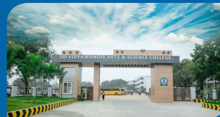
SRI VIDYA MANDIR ARTS & SCIENCE COLLEGE (AUTONOMOUS) KATTERI – 636 902, UTHANGARAI, KRISHNAGIRI (DT)