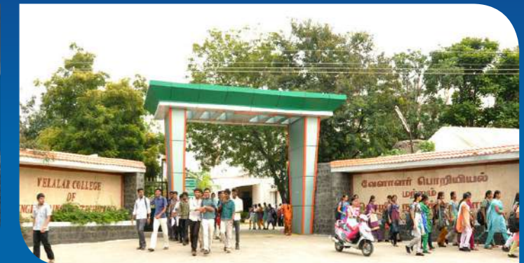
VELALAR COLLEGE OF ENGINEERING AND TECHNOLOGY (AUTONOMOUS), THINDAL ERODE, TAMIL NADU