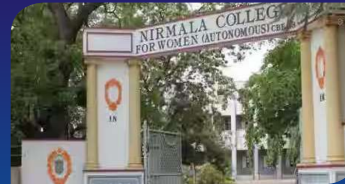
NIRMALA COLLEGE FOR WOMEN (AUTONOMOUS) COIMBATORE, TAMIL NADU