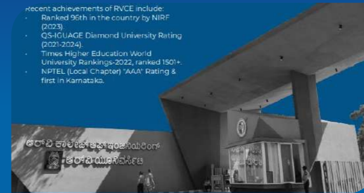
RV COLLEGE OF ENGINEERING (AUTONOMOUS) INSTITUTION AFFILIATED TO VISVESVARAYA TECHNOLOGICAL UNIVERSITY, BENGALURU, KARNATAKA