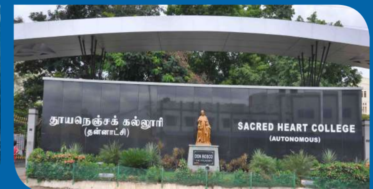
SACRED HEART COLLEGE (AUTONOMOUS), TIRUPATTUR, TAMILNADU