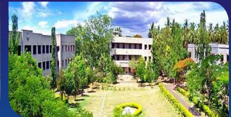
SRI RAMAKRISHNA MISSION VIDYALAYA COLLEGE OF ARTS & SCIENCE (AUTONOMOUS) PERIYANAICKENPALAYAM, COIMBATORE, TAMIL NADU